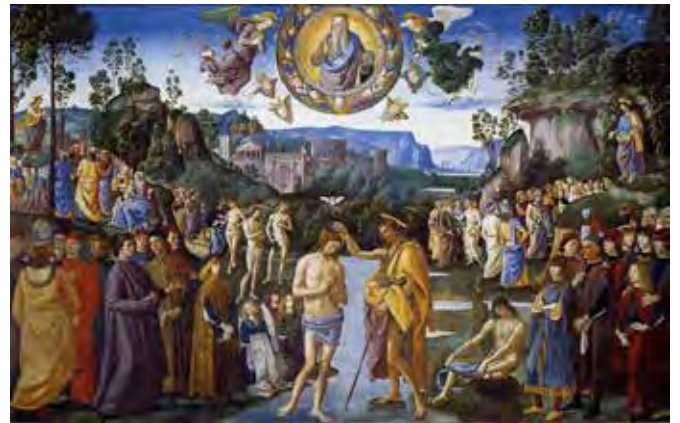
Baptism of Christ by Perugino. Located in the Sistine Chapel. See this website for an explanation of the painting.

16 As soon as Jesus was baptised, he went up out of the water. At that moment heaven was opened, and he saw the Spirit of God descending like a dove and alighting on him. 17 And a voice from heaven said, "This is my Son, whom I love; with him I am well pleased."